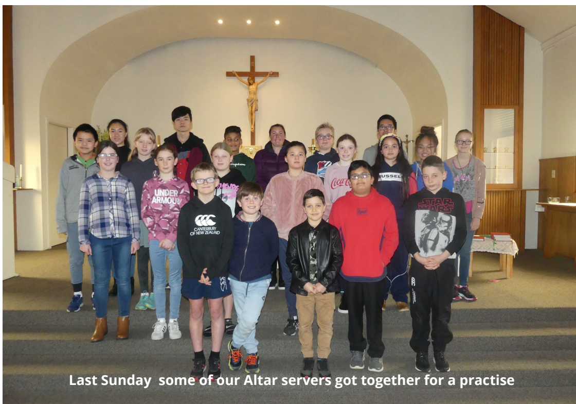
Last Sunday some of our Altar servers got together for a practise

"The new North Parish Website is live! Check it out at http://christchurchnorth.org.nz/ "